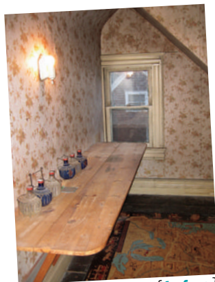
{ before }